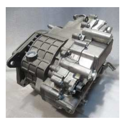
<Example : Integrated Motor/Inverter for EVs>